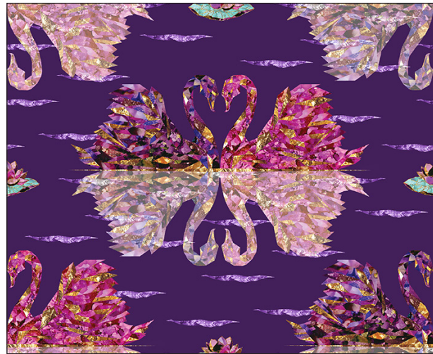
1637-55 Swans - Purple