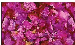
1635-22 Tie Dye Texture Pink