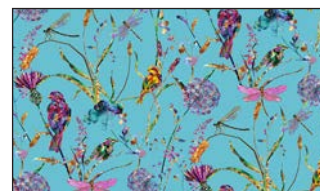
1636-74 Birds and Dragon- flies with Flowers - Sky