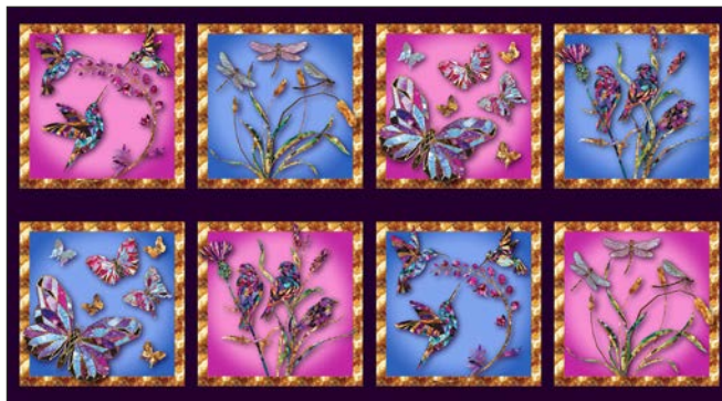
1629-70 Blocks with Birds & Butterflies Blue