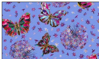
1630-72 Butterflies with Dandelions - Periwinkle