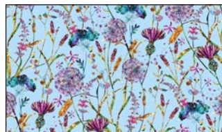
1633-11 Floral Allover Lt. Blue