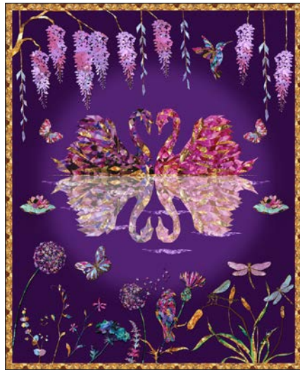
1639P-55 Swans Panel - Purple