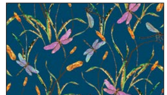
1631-76 Dragonflies with Cattails - Teal