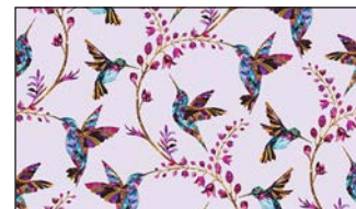
1634-20 Hummingbirds Lt. Pink